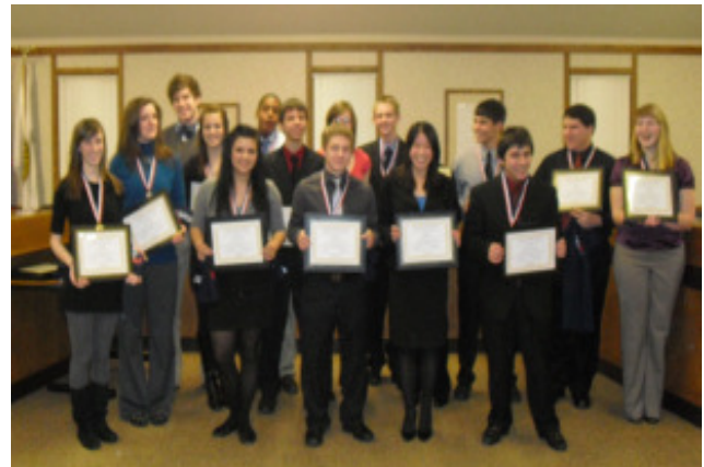
"We The People" Team wins State Championship in Constitutional Debate Competition. They will travel to Washington, DC, to compete nationally.